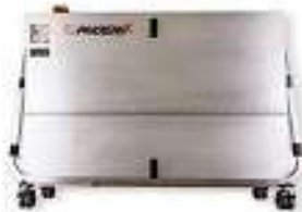
PHOENIX (8 Tamponi)